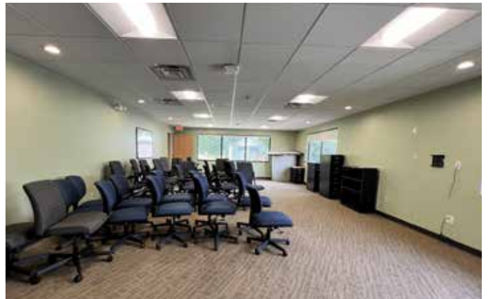
Common Conference Room