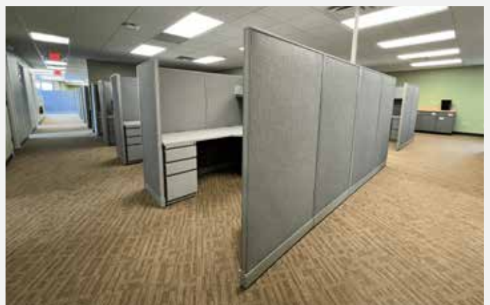
Abundant Office Space