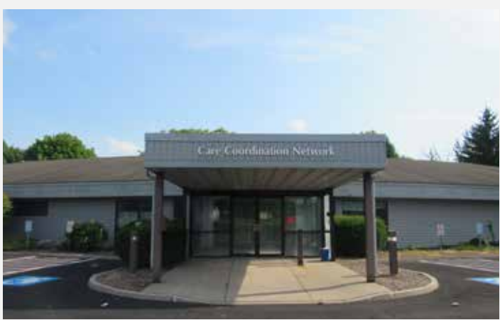
Beautiful Entrance Area